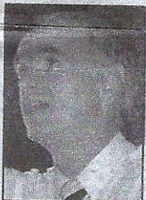
BUCKINGHAM in 1987

"As a person and as a friend, he was A plus, too. He was the kind of person who would receive people from different strains of Christianity and make them feel comfortable and accepted."