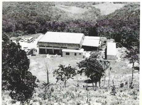
18-acre complex is on a mountain